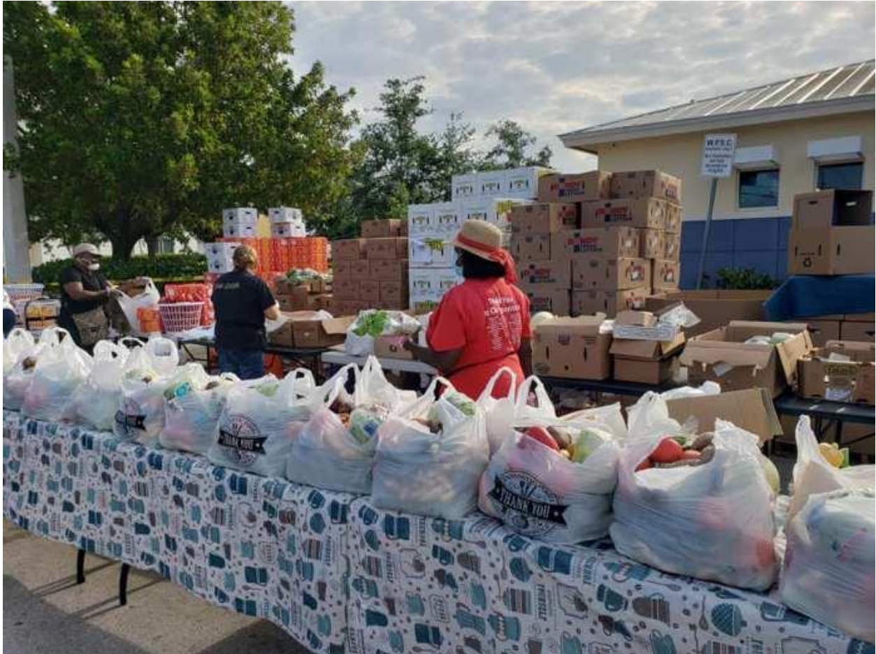
Hollywood organizations providing food for people in need

Because of the COVID-19 crisis, times are tough for hardworking Hollywood residents. Many are struggling to pay for basic items like food.